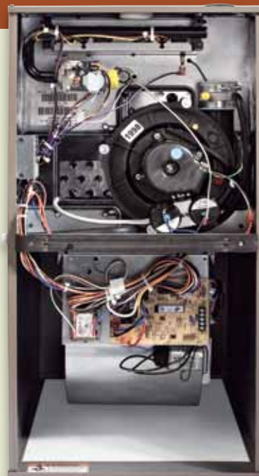
95.5% AFUE model shown

Electronic hot surface ignition saves fuel costs with increased dependability and reliability